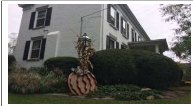
THE HEWES RESIDENCE